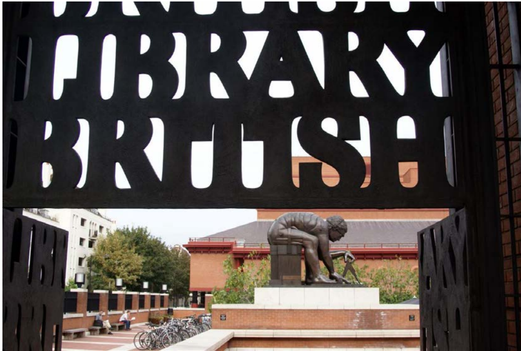
Figure 1 British Library, Euston Road entrance

Having arrived in London on 4 June, the first day of my research began on the following day. Catherine Angerson (Curator, Modern Archives and Manuscripts) at the British Library kindly arranged for me to consult the Maggs Bros archive in their offices rather than in the Manuscripts Reading Room due to it being an unprocessed collection. This also avoided the Maggs folders and bound volumes counting against the ten-item limit that researchers can request per day, which made accessing this material much easier and quicker given my working timeframe.