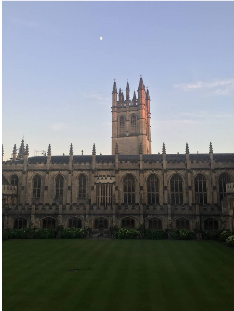
Figure 3 Magdalen College, Oxford