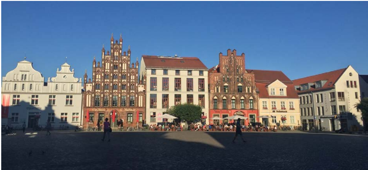
Figure 7 Greifswald, Germany

2018 marks the 550th anniversary of the death of Johannes Gutenberg, the inventor of printing by means of moveable type in Europe. To honour this event the Alfred Krupp Wissenschaftskolleg in Greifswald, Germany, in connection with the State Library Berlin, held a two-day conference titled 'Gutenberg500'.