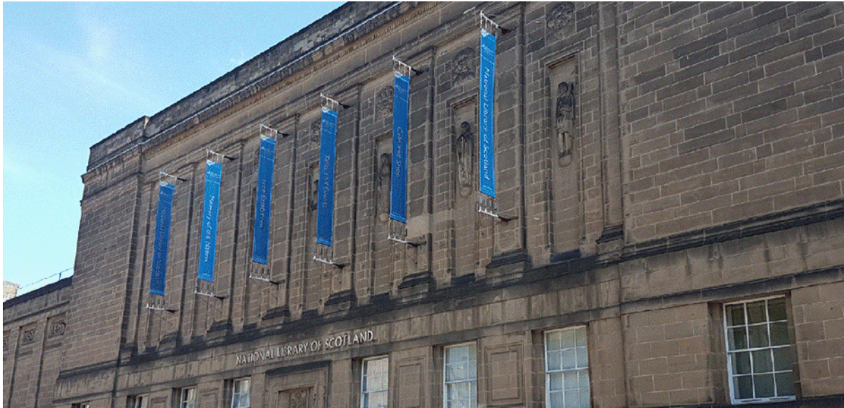
Figure 6 National Library of Scotland