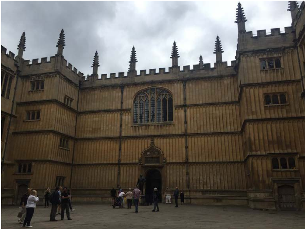
Figure 4 Bodleian Libraries, Oxford

The following day I registered with the Bodleian Libraries and proceeded to its special collections reading room to consult the papers of the London book dealer Bertram Dobell (MSS. Dobell).