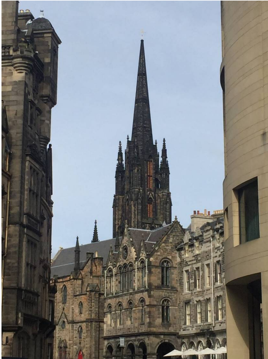
Figure 5 Edinburgh, Scotland

I travelled to Edinburgh on the 22nd, where I had just enough time to register at the National Library of Scotland. While the special collections staff was very helpful and had all the items I requested ready in advance this was perhaps the least successful leg of my trip.